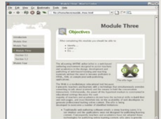
exe Kaupapa Whakaputaina